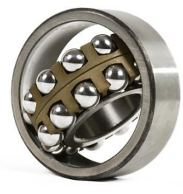
brass cage-two piece