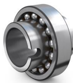
extended inner ring