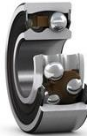
with two seals