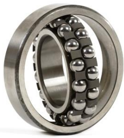
steel cage-one piece